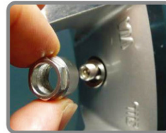
3. Install hexagonal nut into valve stem