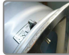
1. Install valve stem into the valve hole of the wheel.

See assembly instructions on reverse side