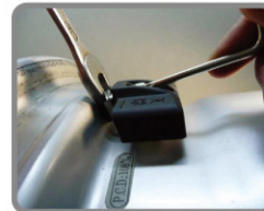
5. Install sensor, make TPMS sensor adjusted to fit the drop well of the wheel. Use wrench to hold valve stem and maintain vertical position, then tighten screw with 4Nm (±0.5) torque.