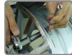
4. Use wrench to hold valve stem and keep vertical, meanwhile use torque wrench to tighten hexagonal nut.